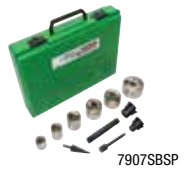
SPEED PUNCH Kit Large Diameter 2½" TO 4" CONDUIT